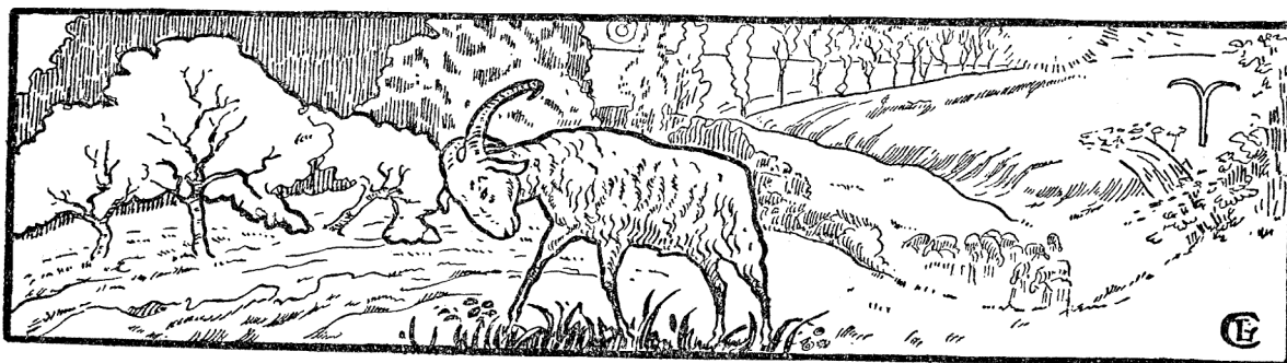
A Character Delineation of the Children Born between March 21st and April 19th, inclusive.

The children born during the time that the Sun is passing through the determined and vital sign of Aries are self-assertive, aggressive, and of an impulsive nature. They resent imposition, are quite fiery in temper, but they are also ready to forgive, holding no resentment.