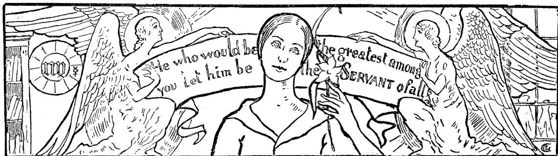
A Character Delineation of the Children Born between August 24th and September 23rd, inclusive, 1925.

The children born this year while the sun is passing through the sign of Virgo will not have the usual timidity of Virgo because Mars, the planet of aggression, is in conjunction with the sun in Virgo throughout the entire month. They will also largely come out victorious in their ambitions and desires, for the great giver of gifts, Jupiter, is in the persistent sign of Capricorn, making a sextile to the persevering Saturn in the determined sign of Scorpio.